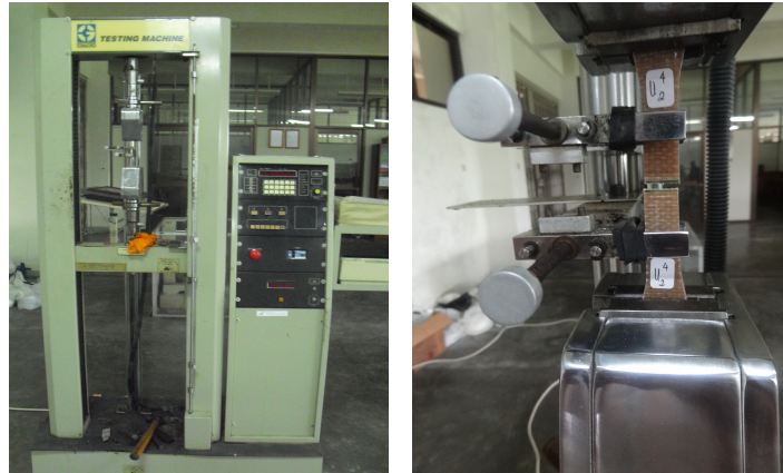
Figure 1. Go Tech Universal Testing Machine

The steps for tensile testing of specimens are; (1) measuring the dimensions of specimens include the length, width and thickness; (2) labeling of serial numbers and bamboo strip woven composites on each specimen after measuring to avoid recording errors; (3) turn on Geo-Tech universal machine for tensile testing; (4) installation of test specimens on the top part of the tensile test machine; (5) attaching it carefully to the testing specimen perpendicularly, then tighten it so that the specimen does not slip on the holder but do not excessive tightening to avoid the damage specimens; (6) attaching the elongation pointer to the line length of the narrow section; (7) then, specify the load used in the test and the speed, with selecting a constant speed of 4 mm/min with a loading of P = 1000 kg. After the engine was run, we observe the indicator load and the indicator elongation on the test machine until specimen breaks. The machine was automatically recorded stress-strain curves on the graph paper. After the tensile testing, the data result was continued to calculate and analyze the tensile strength.